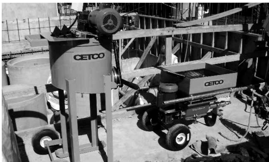
Figure 2: CETCO pump and mixer with electric 1HP motor

Insert injection pipe as close as possible to the foundation wall at 0,6 m–1,2 m on centre and push pipe down to the top of the footing or the desired depth. Use a “Tile Rod” or long drill bit to start the first few feet of the injection hole.