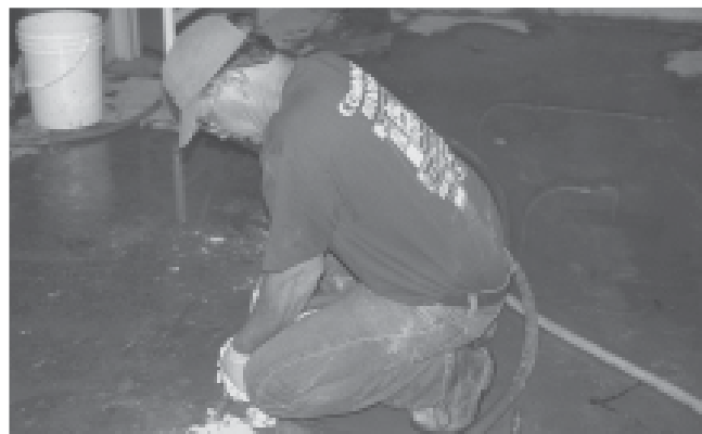
STRUCTURAL SLAB APPLICATION: Inject BENTOGROUT under an existing slab to provide waterproofing and fill void areas