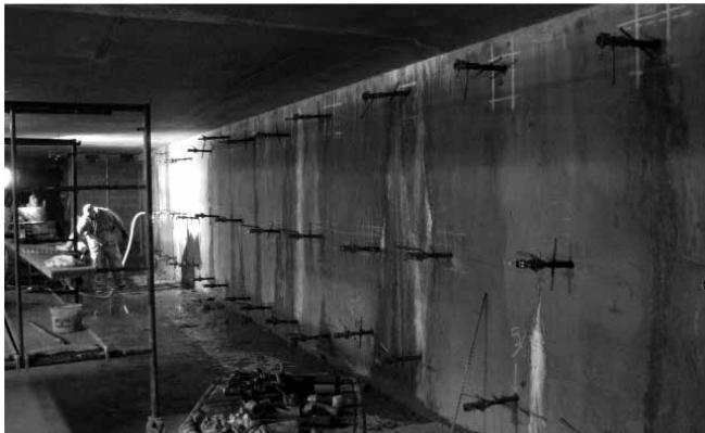
INTERIOR SURFACE GROUT INJECTION: BENTOGROUT is applied to the inside of the building without excavating the site