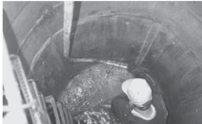
INTERIOR THROUGH WALL APPLICATION: BENTOGROUT injected to the exterior of a manhole through pre-drilled holes using a short injection wand