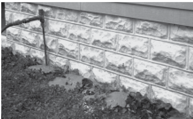
EXTERIOR MASONRY WALL APPLICATION: Inject BENTOGROUT along the exterior of a foundation wall at 600 mm on centre intervals