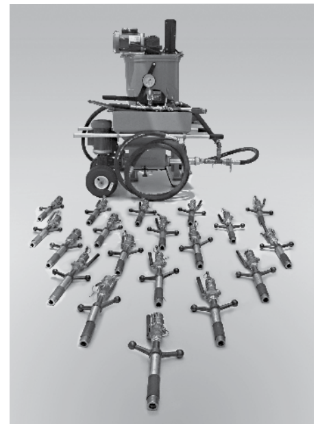
CETCO BENTOGROUT Pump, Mixer and Accessories

Caution: Pumping any material under pressure can cause lifting or movement of adjacent structures.