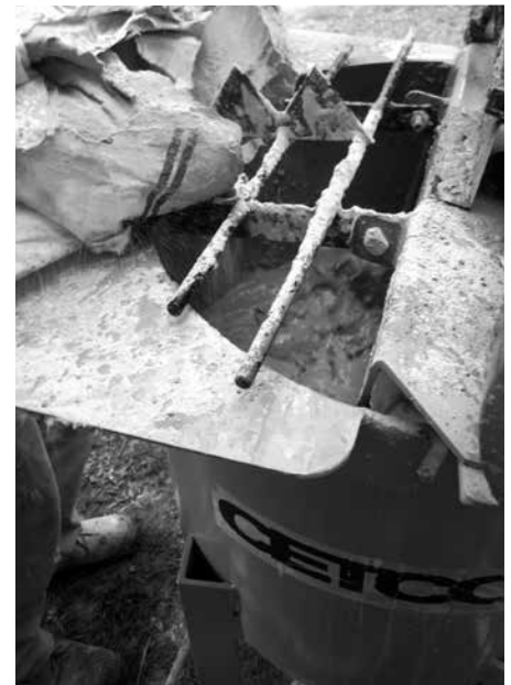
Mixing BENTOGROUT in CETCO mixer

Limitations: BENTOGROUT is not designed to bridge cracks or gaps larger than 3 mm. Interior surface cracks greater than 3 mm should be surface sealed with cement based patching material to prevent grout extrusion into the structure. BENTOGROUT is not designed as a structural patch. BENTOGROUT is not recommended for above ground or applications that do not provide proper confinement. BENTOGROUT is not suitable for sealing expansion joints.